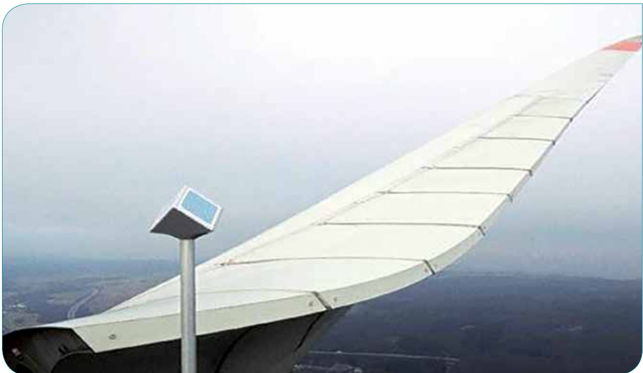
Pic: IDS-Cube-Sensor at a wind turbine in Germany