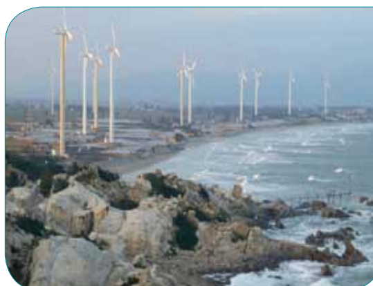
Pic: Wind farm at the coast