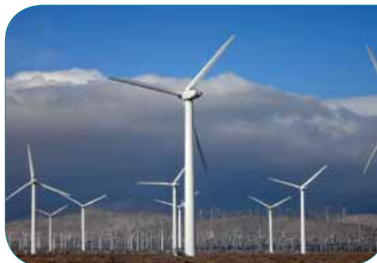
Pic: Wind farm in the US

The IDS-30 can be connected to radio modem that will transmit the measurement data wireless to other turbines or in a close by command center. As well to a signal or alarming post that will signal ICE throw or ICE fall danger in the area.