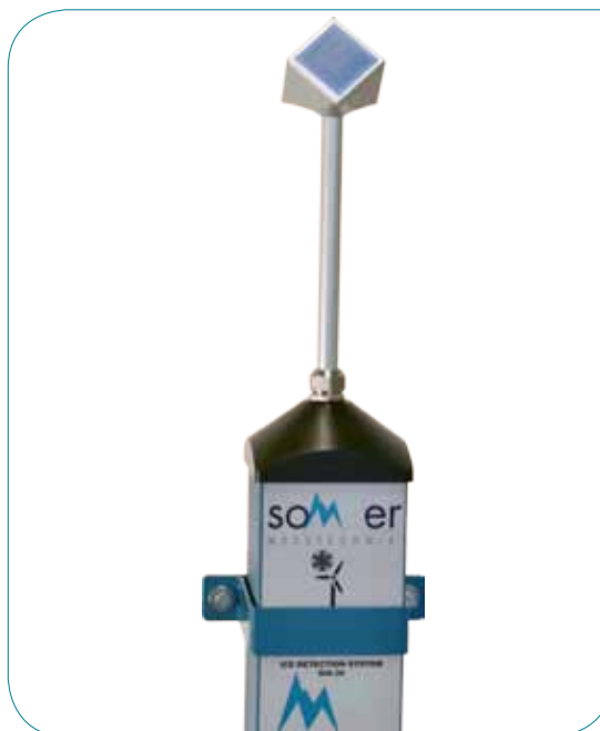
Pic: IDS-Cube sensor