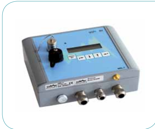
Pic: 2G/3G/4G data connections

The IDS-30 can be connected to the MRL-7 SOMMER data logger and remote access unit. The MRL-7 data logger saves the data and transfers them either immediately or periodically to various addresses. In that way the user can retrieve the latest data online and therefore has an overview of the potential danger spots any time. Additionally a notification service can be setup, which – in case of need – can inform dedicated people via SMS or E-mail, about exceedance of limit value.