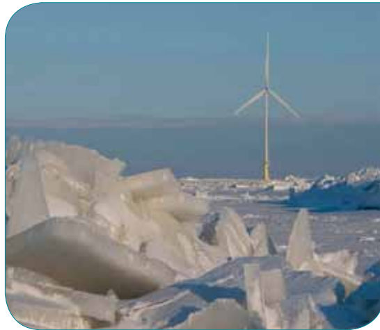
Pic: Wind turbine